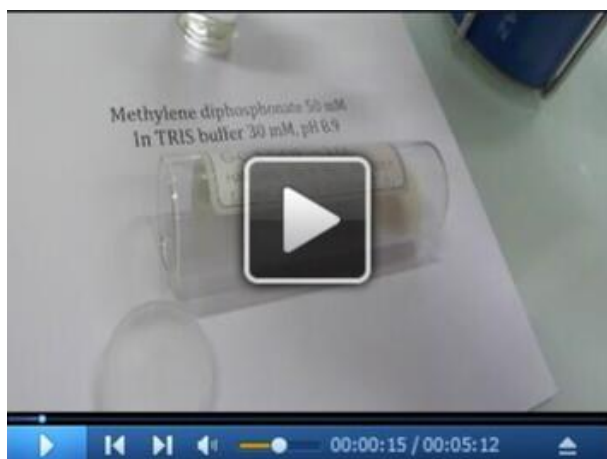
Video 1. Making the chemical shift reference with MDP solution