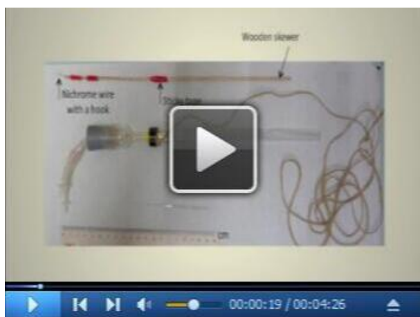
Video 2. Experimental set-up for in vivo NMR measurements