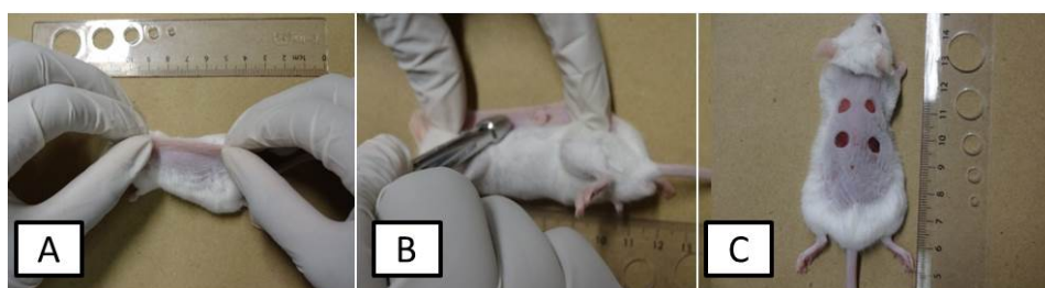
Figure 1. Stepwise skin excisional wounding surgery. Fold and raise the dorsal skin cranially and caudally at midline to form a sandwiched skinfold (A). Place the animal in a lateral position and punch through the folded skin (B) to create symmetrical full-thickness excisional wounds (C).