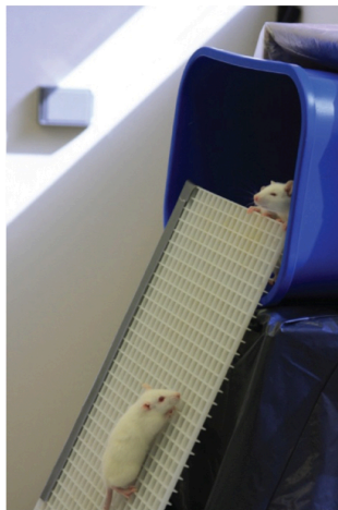
Figure 2. Wire mesh ascending test