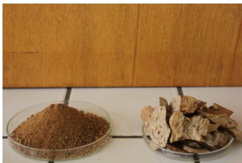
Figure 1. Bark of Rauvolfia nukuhiensis after and before the grinding process