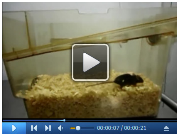
Video 1. Example of a wild-type mouse foraging during the test. The chow pellet is located in the right corner. The digital stopwatch is halted as soon as the mouse touches the pellet.